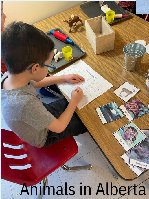
Animals in Alberta